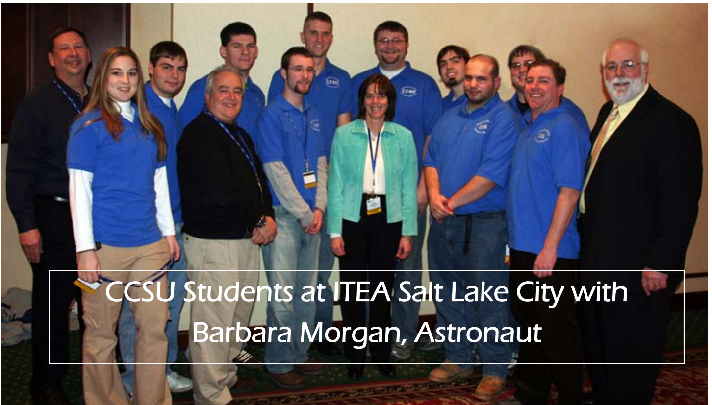
CCSU Students at ITEA Salt Lake City with Barbara Morgan, Astronaut